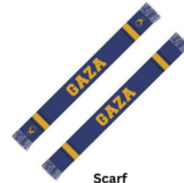
Scarf Custom Scarf