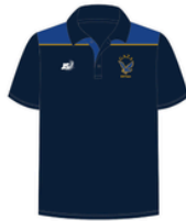
Polo Unisex 120th Anniversary P761

25% OFF 25% OFF 25% OFF 25% OFF 25% OFF 25% OFF 25% OFF 25% OFF 25% OFF 25% OFF 25% OFF 25% OFF 25% OFF 25% OFF 25% OFF 25% OFF 25% OFF 25% OFF 25% OFF 25% OFF