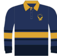
Rugby Top P40