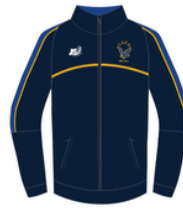
Apex Jacket P675